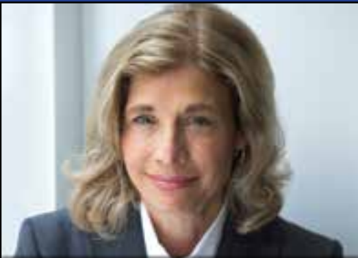
VITA RABINOWITZ INTERIM EXEC. VC & PROVOST, CITY UNIVERSITY OF NEW YORK