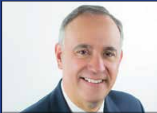
FÉLIX MATOS RODRÍGUEZ CHANCELLOR, CITY UNIVERSITY OF NEW YORK